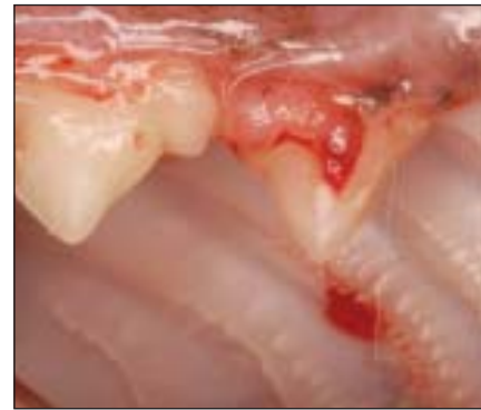
A feline odontoclastic resorption lesion (FORL).

The study found a significant correlation between feline retrovirus infection and oral disease. Based on these results, practitioners should begin to incorporate retrovirus testing into their oral health protocols—specifically, testing cats for feline leukemia virus (FeLV) and feline immuno-